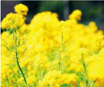
Field mustard March to April