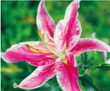
Lilies June to July