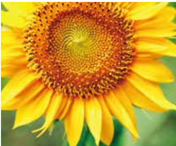
Sunflower July to August