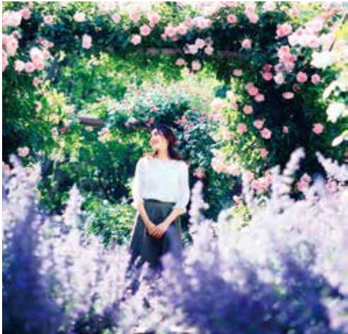
Four Seasons Garden