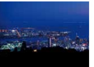
Nightscape from view plaza