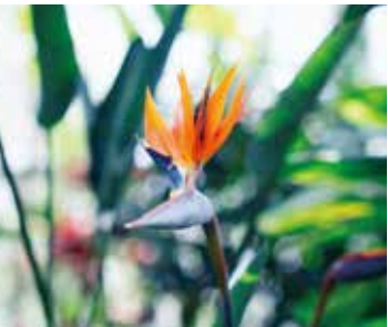
Sutorerichia December to March