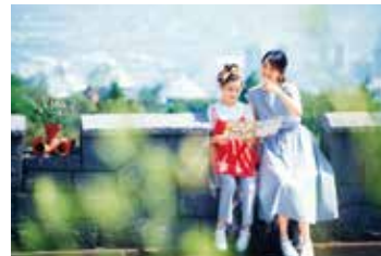
Treasure Hunting Game