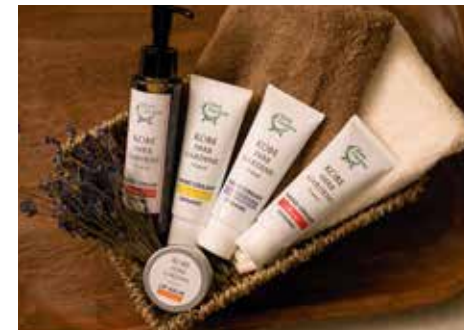
Body Cream / Hand Cream / Lip Balm