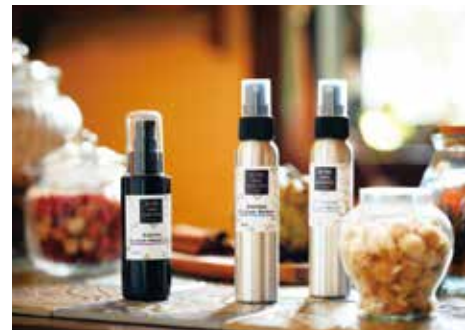
Aroma Clear Hand Gel / Aroma Clear Spray / Outdoor Body Mist