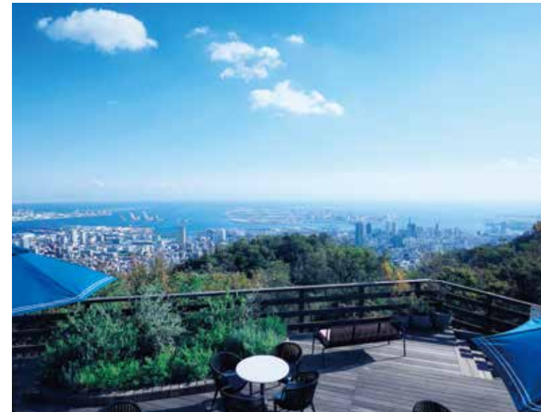
THE VERANDA Terrace