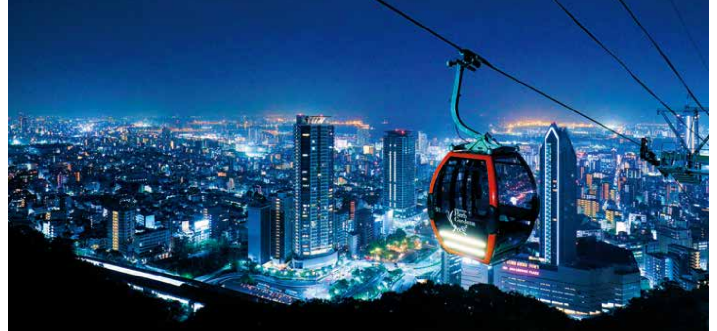
Nightscape from ropeway

The Herb Gardens offer an amazing view of Kobe. THE VERANDA in glasshouse is the perfect place to experience Kobe while surrounded by greenery and flowers and with a gentle breeze. A lawn area on the hill offers a stunning view of the Kobe cityscape and the sea beyond. Sitting in nature staring at the sea is a recipe for some wonderful memories. The sea and sky are painted a deep blue color as evening turns to night - truly a sight to behold. Check out the beautiful illumination on the Observation Tower at night when the fantastical “forest of illuminations” comes to life.