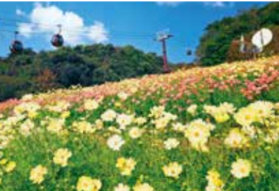
Kaze no Oka Flower Garden