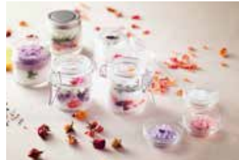
Seasonal herb craft