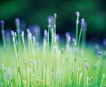
Lavender May to July