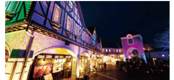
Magical Space “Forest of Illuminations”