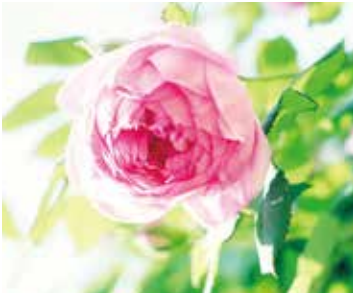
Rose May to June