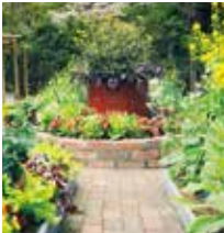
Kitchen Garden "Potager"