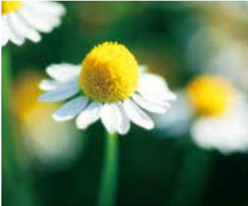
German chamomile May to June