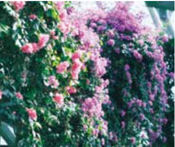
Bougainvillea January to March