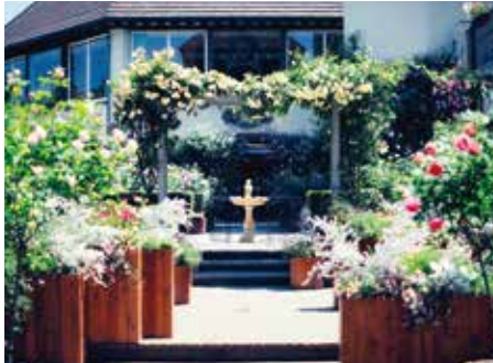
Rose Symphony Garden