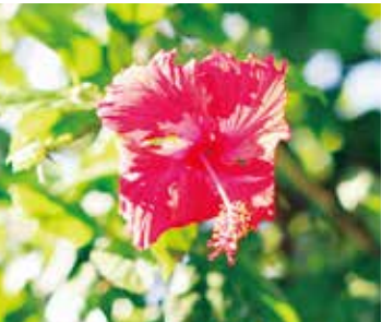
Hibiscus December to March