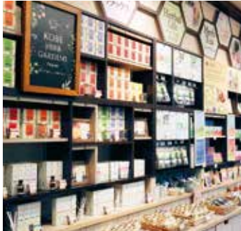
The Store at the Top of the Mountain