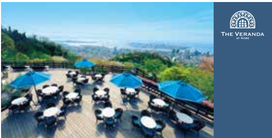
The Veranda at Kobe