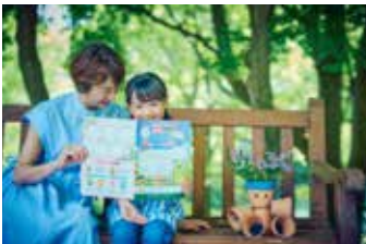
Treasure Hant Game