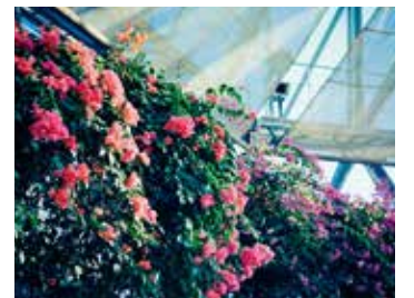
Bougainvillea January to March