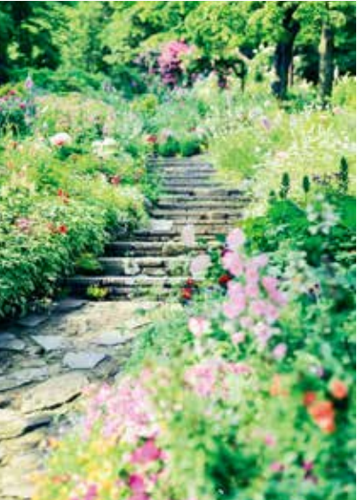
Four Seasons Garden