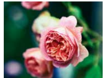
Rose May to June