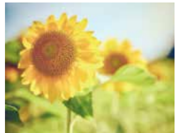
Sunflower July to August