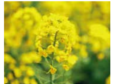
Field mustard March to April