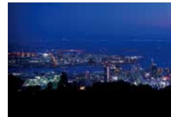
Nightscape from View Plaza