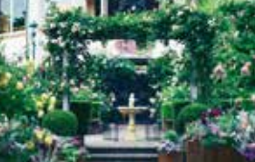
Rose Symphony Garden