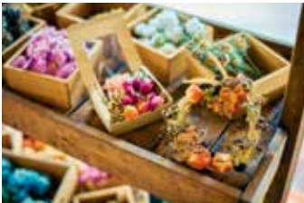
Seasonal Herb Craft