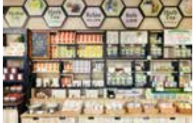
The Store at the Top of the Mountain