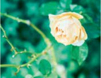
Rose October to November