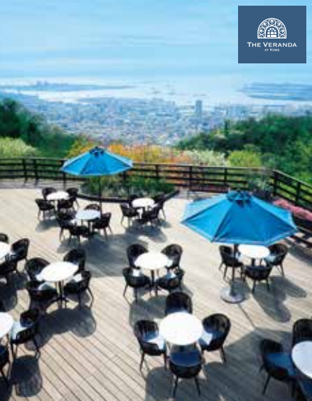
The Veranda at Kobe