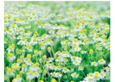
German chamomile May to June