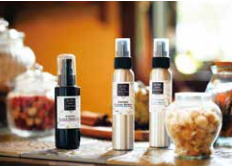
Aroma Clear Hand Gel/Aroma Clear Spray/Outdoor Body Mist