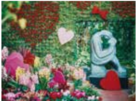
Glasshouse / The Statue of Love