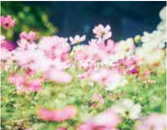
Cosmos October to December