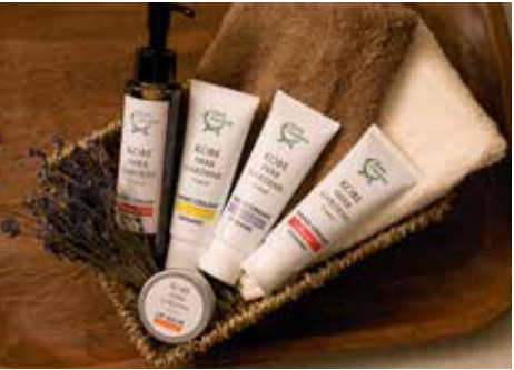
Body Cream / Hand Cream / Lip Balm