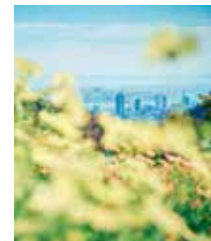
Kaze no Oka Flower Garden