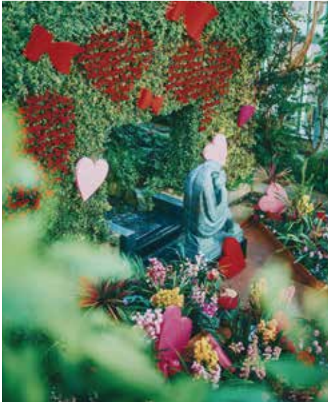
The “Statue of Love” was donated by Terni City in Italy, the birthplace of Saint Valentine. It shows the tender love of a mother holding her child. The spot is known for soothing the heart and expressing love.