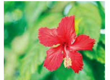
Hibiscus December to March