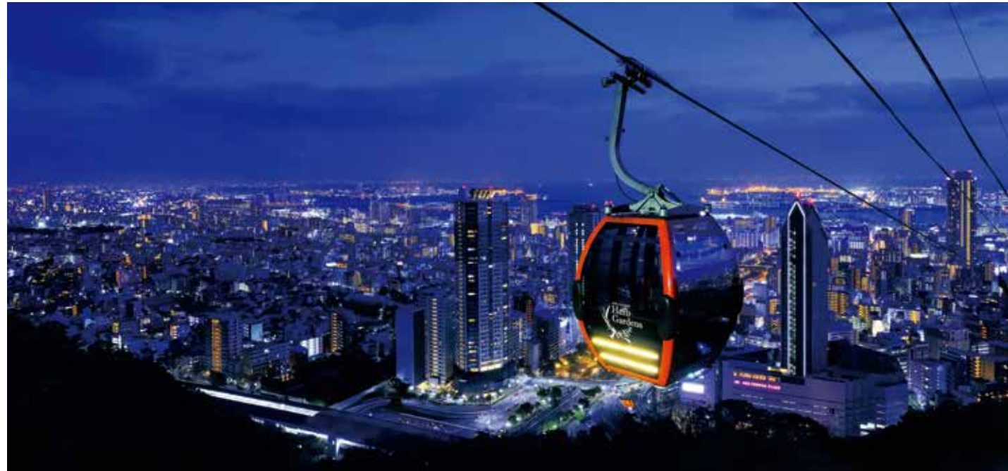
Nightscape from Ropeway