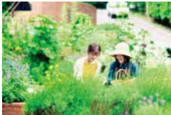
Herb Guided Tour