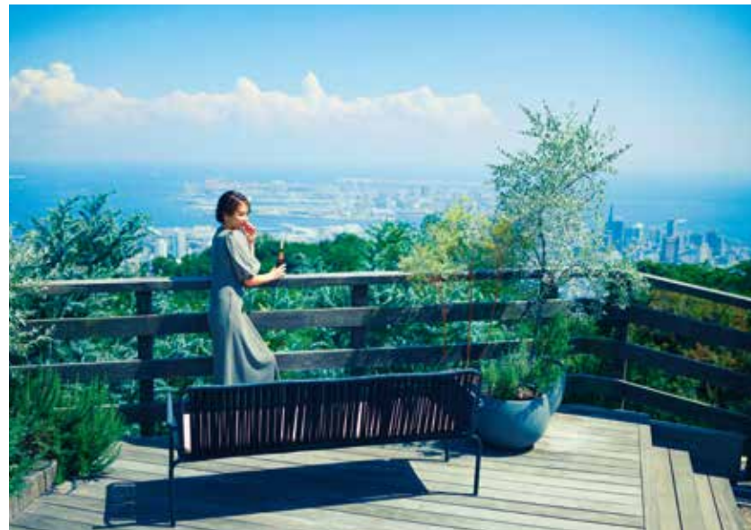
THE VERANDA Terrace