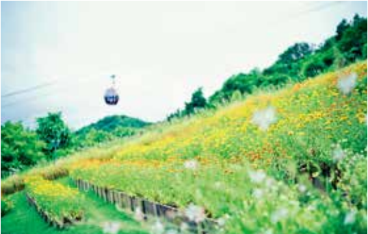
Kaze no Oka Flower Garden