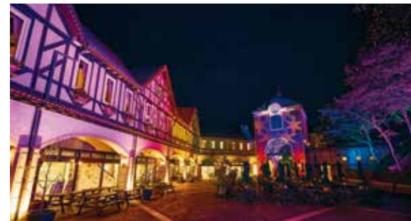
Magical Space “Forest of Illuminations”