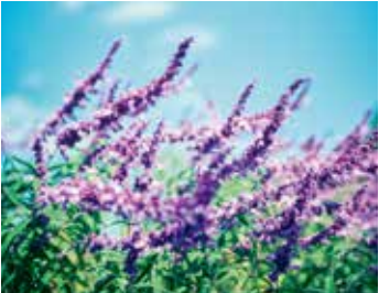
Sage September to December