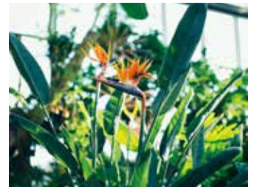
Sutorerichia December to March