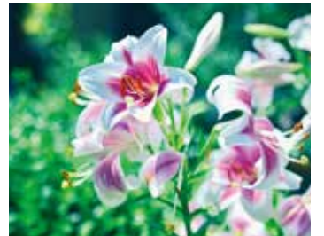
Lilies June to July