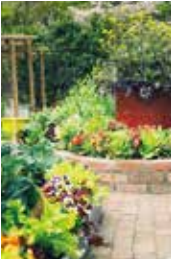
Kitchen Garden Potager